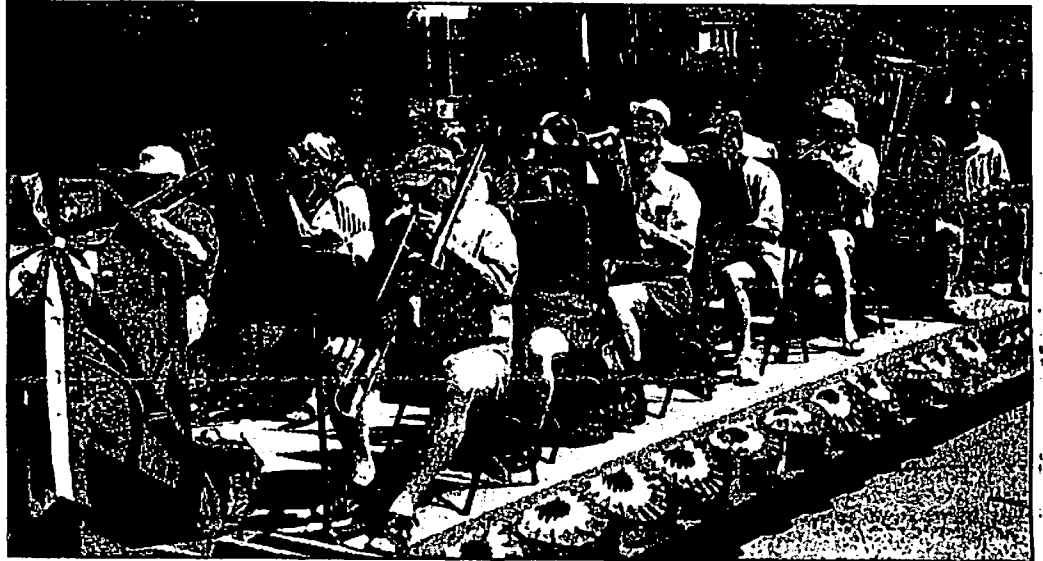
The South Shore Bay Band played Friday night at DHS and again during Monday's parade.